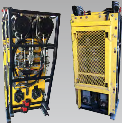
X- 250 SHOWN