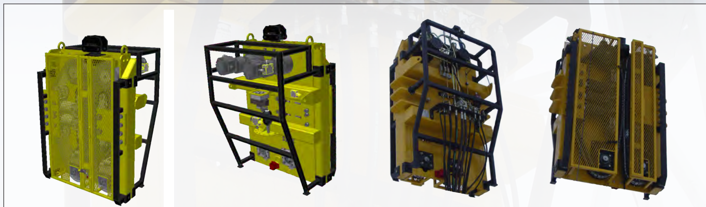
X- 300 SHOWN